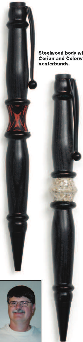
Steelwood body with Corian and Colorwood centerbands.