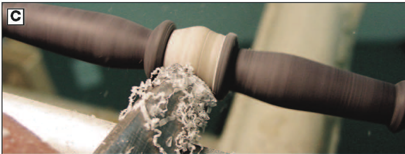
C To assure pleasing proportions, turn the centerband at the same time as the barrels.