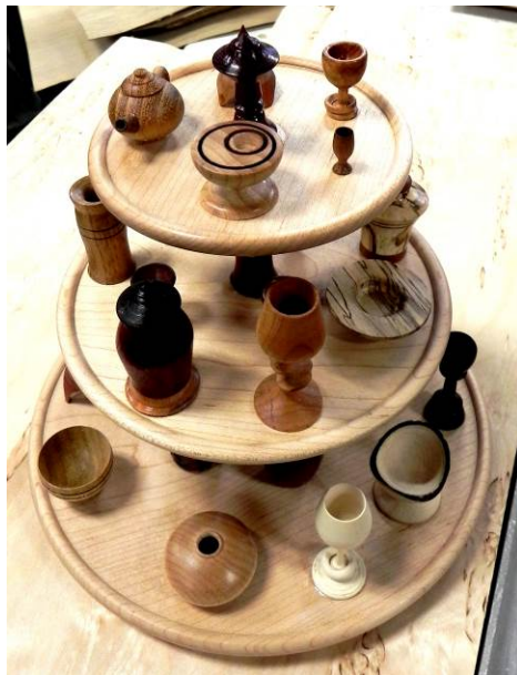
Item being raffled