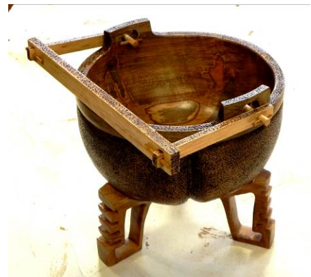
With Patience and skill, this is what you can create.