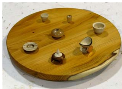
Bob Fentress -7 miniatures, tiny natural edge bowl, teeny weenie holly hollow form, leg box of cedar