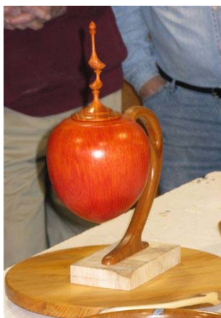
Peter Richichi -4-5 "closed end elm vessel with tung oil, 14" maple bowl