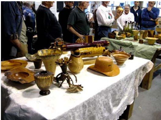
Paul MacMenamin -bottle tops of ash, lignum vitae