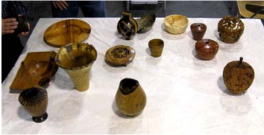
Hal Usher -oak burl bowl, sea grape (tropical wood) bowl, rain tree bowl from St John's Island