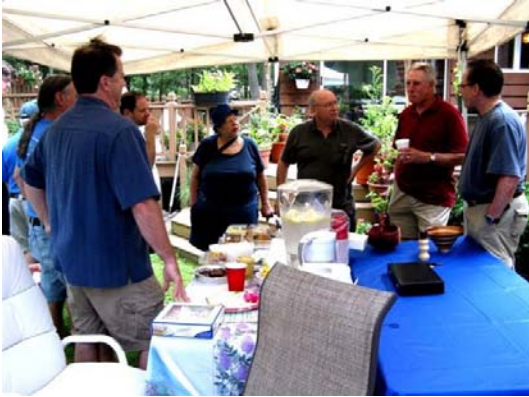
Seeking shelter from the rain