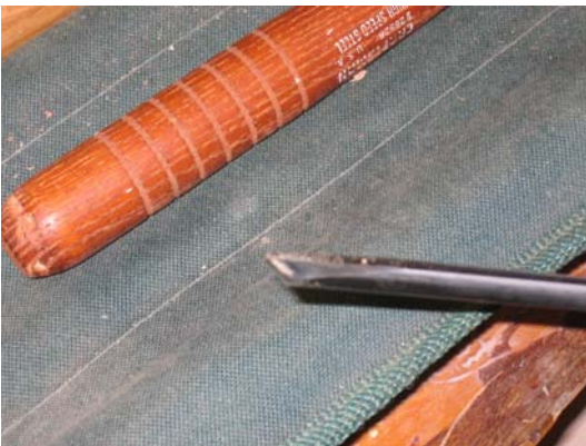
Keith's gouge profile